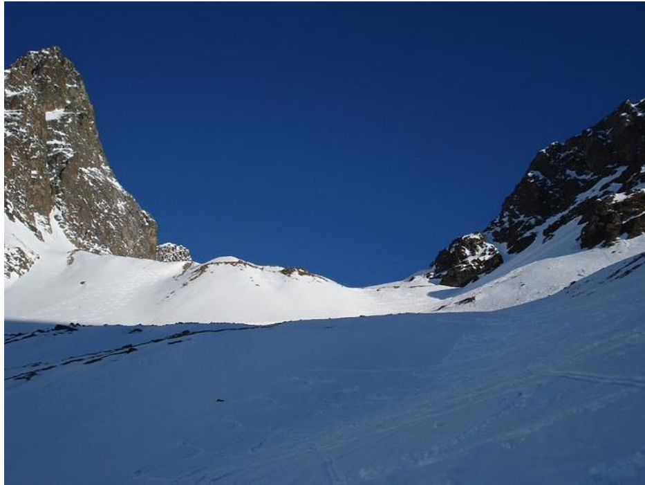
The Furcla Vermunt passage to Austria

A short lunch and a short drop on a traverse lead us to the NW facing slope of the Dreiländerspitz (Route 624a rated ZS-).