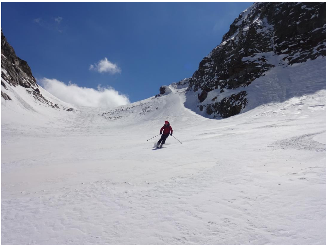
Spring snow in the Verstancla valley, with the pass at the top

before another short skin up to the Verstanclator pass (2923 M), and then down the long Verstancla valley to Klosters