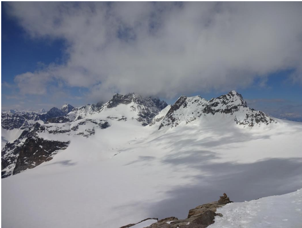
La Cudera Glacier

before another short skin up to the Verstanclator pass (2923 M), and then down the long Verstancla valley to Klosters