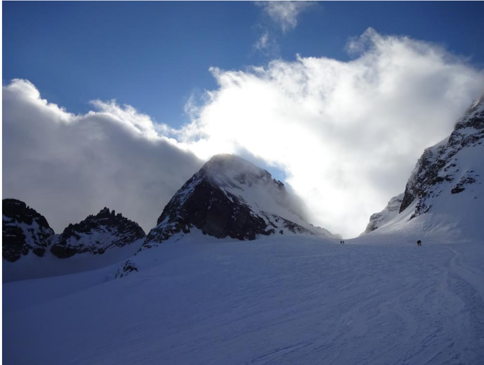
Approaching the Piz Buin

There followed a 35-minute scramble up the best known peak in the Silvretta region, the Piz Buin at 3312 Metres, also on the Swiss/Austrian Border. Sadly, shrouded in clouds.