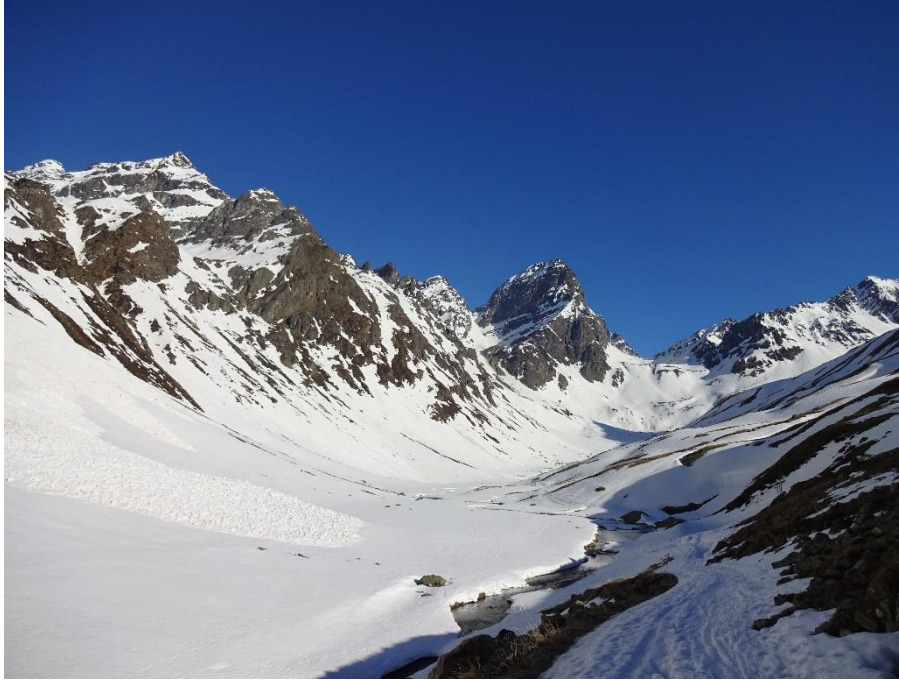
The Tuoi Vallee

We left Guarda (1580 M) at 6.45am. An hour of walking in grass meadows with skis on our backpacks, and then skinning (Route 65 on the TARASP touring map) had us reaching the Tuoi Hut around 9.15. We stopped for a drink, and then climbed