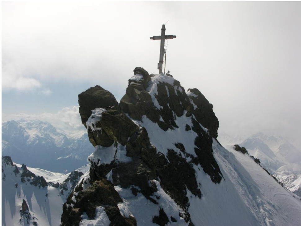
The approach to the peak

There followed a quite steep 300 M skinning ascent, criss-crossing the glacier. Leaving our skis and pack at the base of the rock outcrop, Dres roped me up and we scrambled and climbed perhaps 100M to the three countries peak at 3197M.