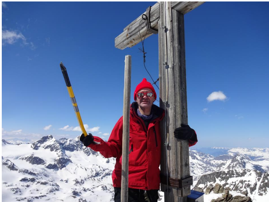
Hanging on to the Cross,

Although not technically difficult to climbers, the narrow ridge certainly pushed my heart rate up.