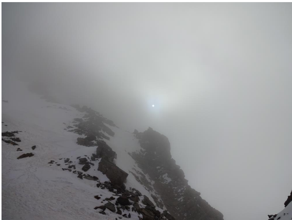
Piz Buin in Cloud, with the sun just poking through

There followed a 35-minute scramble up the best known peak in the Silvretta region, the Piz Buin at 3312 Metres, also on the Swiss/Austrian Border. Sadly, shrouded in clouds.