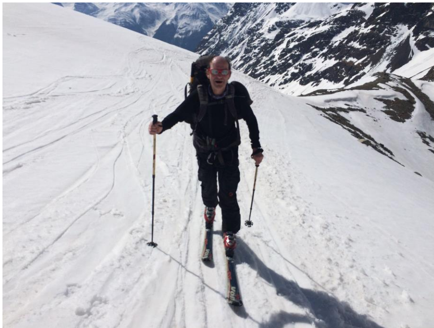
Approaching the Tuoi Hut... already hot

in the hot sun to the Fuorcla Vermunt (2798M), arriving at the Austrian border around 12 noon.